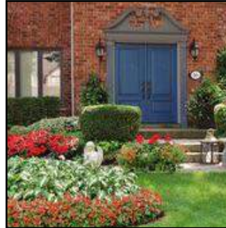
46 Norma Cres.