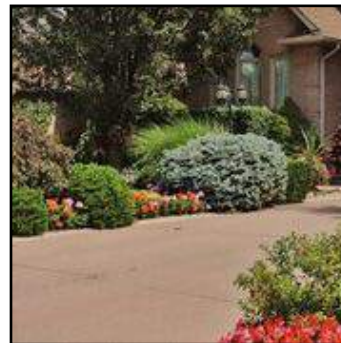
76 Springfield Blvd.