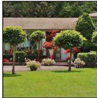
341 English Pl.