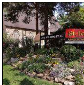
Commercial Winner: St. John's Anglican Church