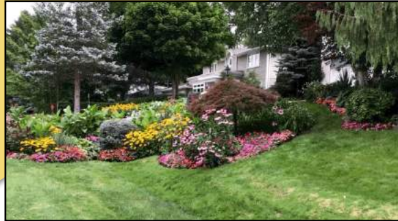
Diamond Award Winner—the gardens at 154 Crestview Drive