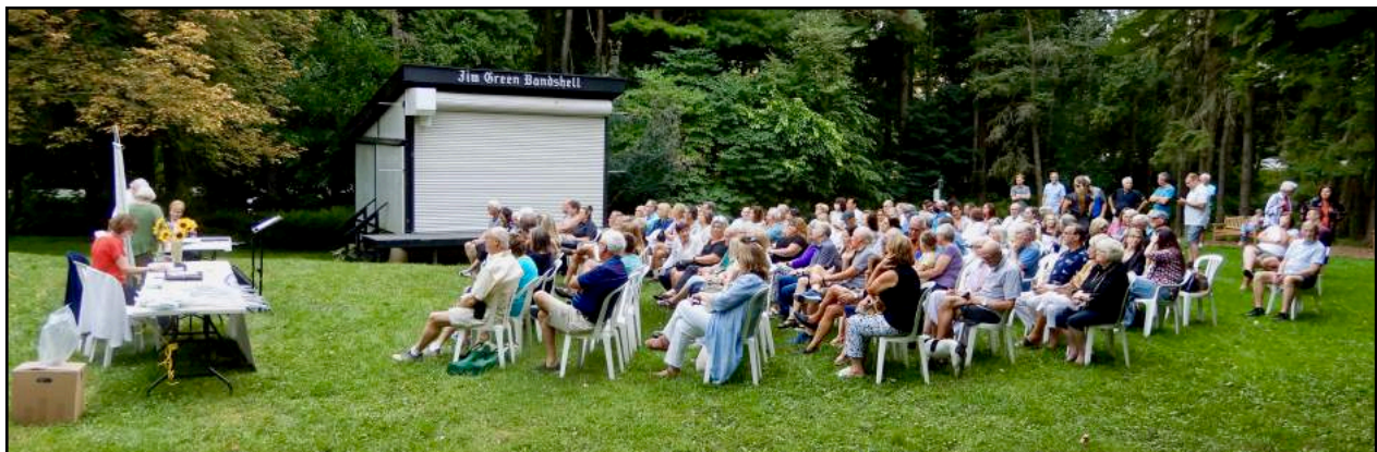
The 2022 Trillium Awards Ceremony at Fieldcote Park