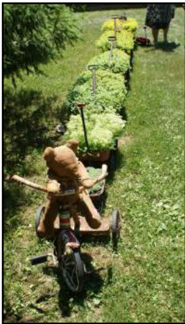
Teddy Bear's Wagon Garden at Beth Powell's Open Garden.