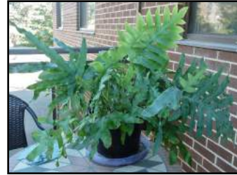
Blue Star Fern—first time growing on my balcony. A great success!