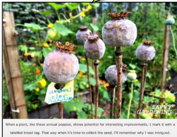
When a plant, like these annual poppies, shows potential for interesting improvements, I mark it with a labelled bread tag. That way when it's time to collect the seed, I'll remember why I was intrigued.

https://savvygardening.com/collecting-seeds-from-your-garden/