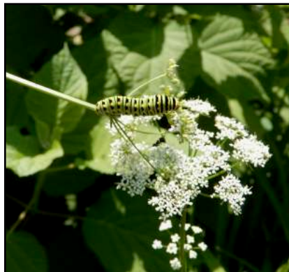
Feeding Pollinators in the Fieldcote Garden. Swallowtail Butterfly caterpillar by David Puskas