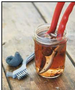
How to Clean & Sharpen Old Pruners