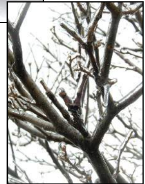
Stormy Days in March