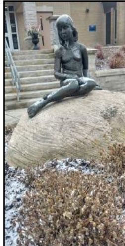
Ancaster's Icy Maiden