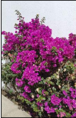
Hello from Mexico!